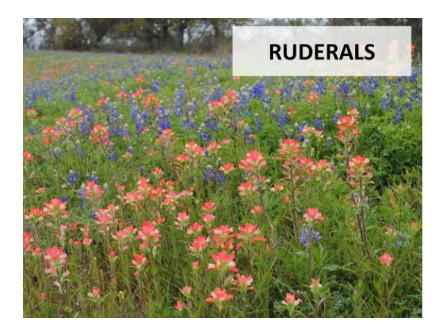
Figure 6 . Ruderals (high disturbance, low stress) are short-lived plants that evolved to deal with frequent interruptions at the ground level (fire, flooding, animal trampling, etc.). They set copious amounts of seed.

Ruderals (high disturbance, low stress) are short-lived plants that evolved to deal with frequent interruptions at the ground level (fire, flooding, animal trampling, etc.) (Fig 6).