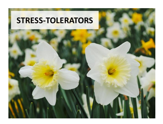
Figure 5 . Stress-tolerators (low disturbance, high stress) usually take 3–7 years to flower, and they often form a storage organ like a bulb, tuber, or corm that allows them to endure harsh conditions (freezing, heat, drought, etc.).

Ruderals (high disturbance, low stress) are short-lived plants that evolved to deal with frequent interruptions at the ground level (fire, flooding, animal trampling, etc.) (Fig 6).