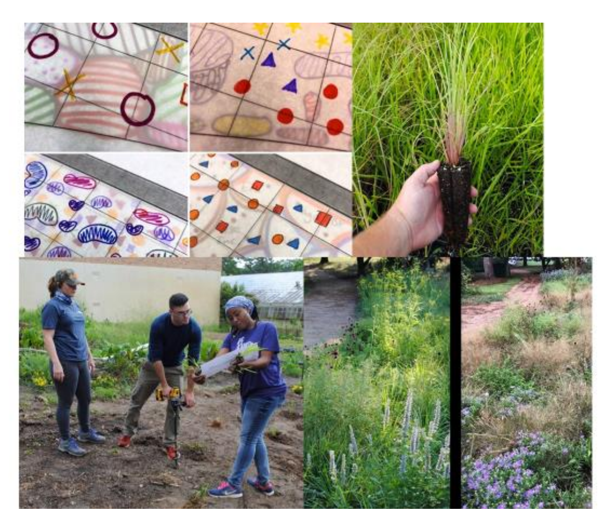
Figure 8 . Naturalistic landscape design and planting using coded planting maps (above left), matching the design with the site (bottom left), seeding and using seedling plugs (above right), and the seasonal change in the naturalistic site (bottom right).