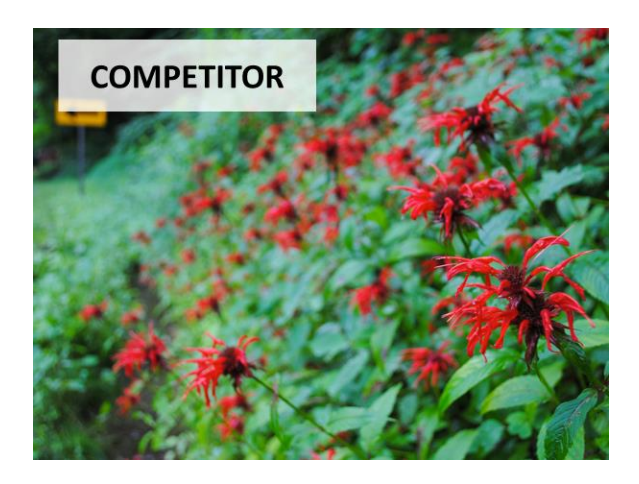
Figure 4. Competitors (low disturbance, low stress) are vigorous growers that out-compete other plants around them.