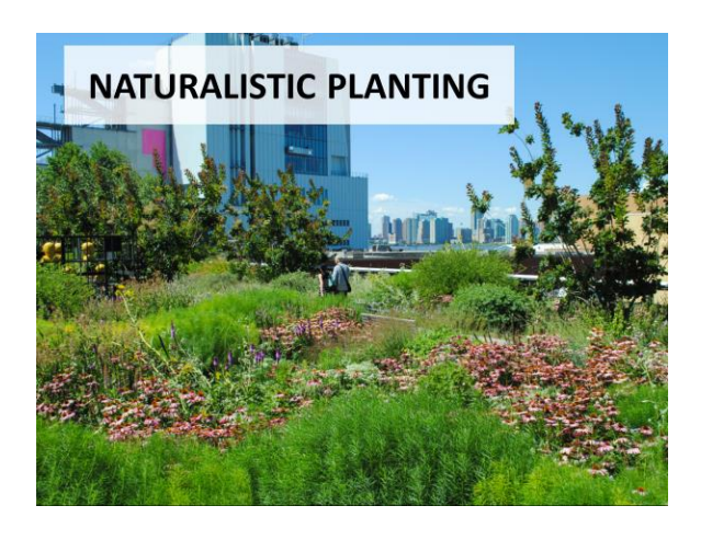
Figure 1 . A naturalistic planting in a highly urban setting.