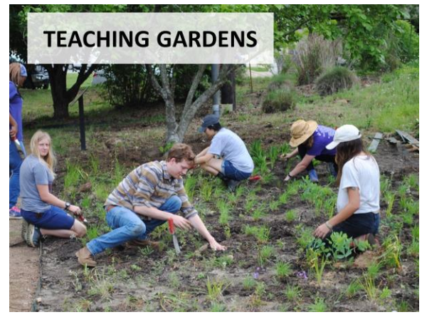
Figure 3 . Stephen F. Austin (SFA) teaching gardens, maintained by students.

Hence, our horticulture program at Stephen F. Austin State University (SFA) is teaching students about sustainable approaches to landscaping in my Herbaceous Plants class (Fig. 3). This paper will describe our efforts to teach students about naturalistic planting and give them hands-on experience in the Plantery, our agriculture department's teaching gardens, micro-farm, and grow houses.