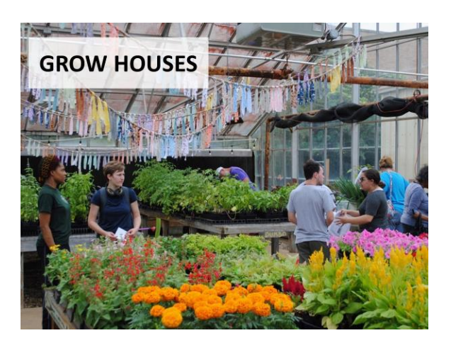
Figure 2 . Stephen F. Austin (SFA) student grow houses used for teaching instruction and growing plants for student sales.

Hence, our horticulture program at Stephen F. Austin State University (SFA) is teaching students about sustainable approaches to landscaping in my Herbaceous Plants class (Fig. 3). This paper will describe our efforts to teach students about naturalistic planting and give them hands-on experience in the Plantery, our agriculture department's teaching gardens, micro-farm, and grow houses.